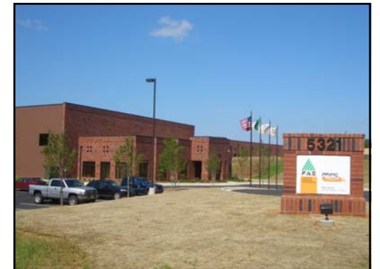
FAE USA, Inc