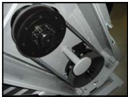
FAE UML/SSL with poly-chain belt

FAE offers v-belts and poly-chain belts depending on model of attachment. All FAE attachments have tensioning devices, which are mounted inside the motor housing, to insure proper belt tension and productivity.