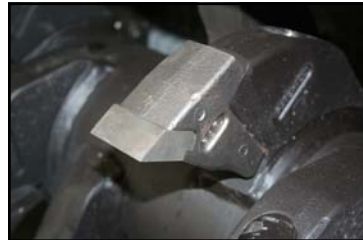
FAE rotor with Viper teeth